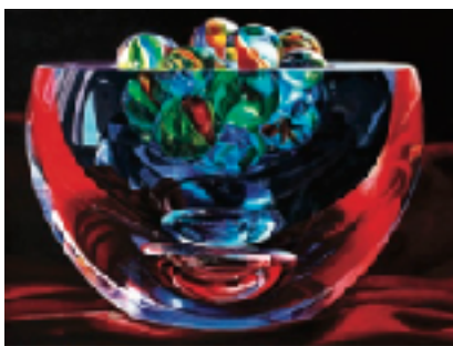
2018 Mixed Media 2nd "CCK-12" by Juergen Strunck (bottom)