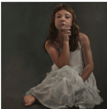
2018 Best of Show "Ella" oil by Amy Werntz. (above)