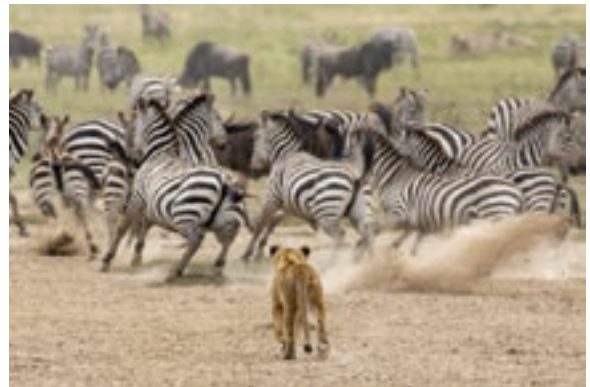
Honorable Mention - Klaus Mayer "Come Play with Me" 20×30