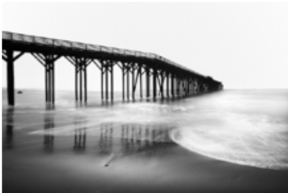
3rd -Hugh Adams "San Simon Pier" 22×30