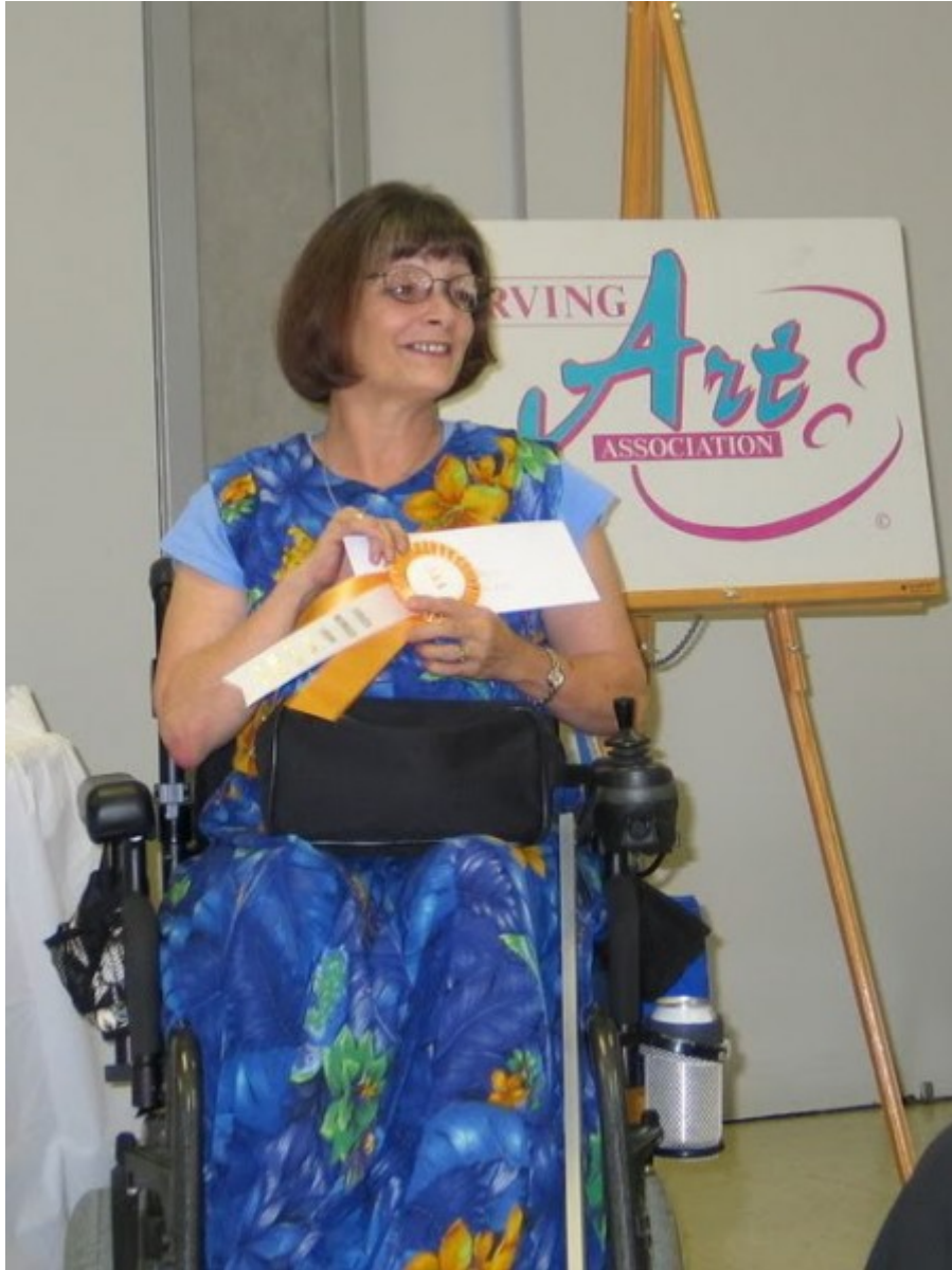
Beverly accepts award at the 50th anniversary IAA Members Exhibit in 2006