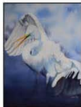
Honorable Mention Elaine Jary, TX Late Afternoon Egret, Watercolor