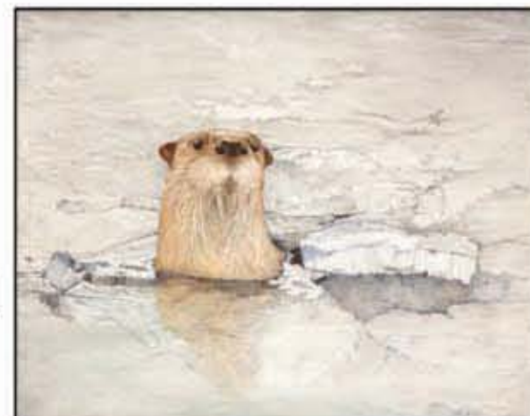
Sheliah Lonian, TX What a Surprise! , Acrylic