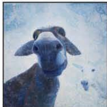
2nd Shelby Prindaville, TX Perspective, Watercolor