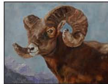
Honorable Mention Debbie Flynn, TX A Beauty up in the Air, Oil