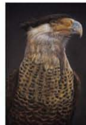
2nd Deb LaFogg, TX Crested Caracara, Pastel