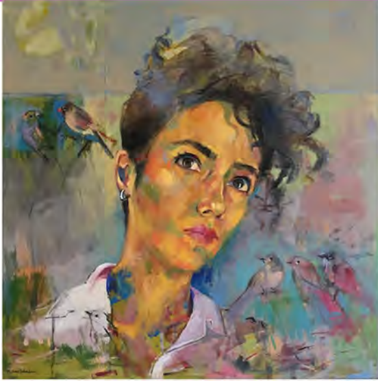
BEST OF SHOW Camouflage by Behnaz Sohrabian