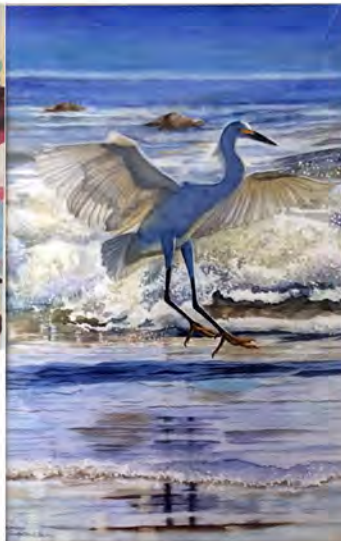
HM Frozen 2 by Brett Dyer